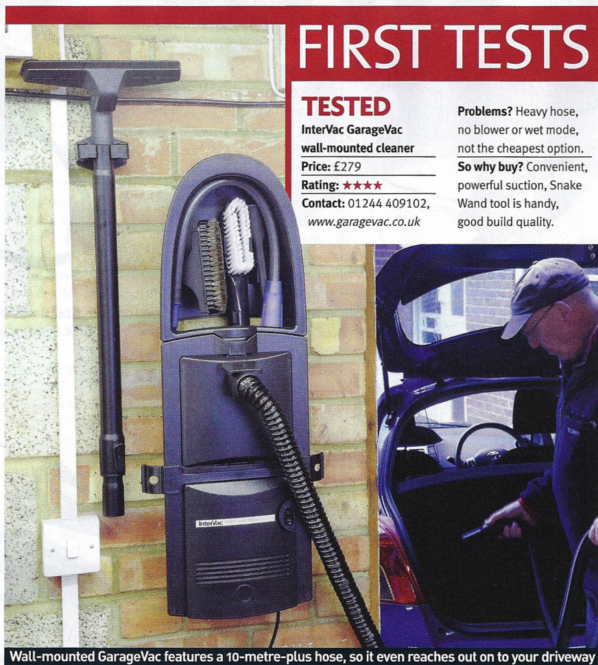
Wall-mounted GarageVac features a 10-metre-plus hose, so it even reaches out on to your driveway

The GarageVac isn't cheap, at £280, and the stretchy hose is heavy, with a firm recoil at full length. But the slender Snake Wand tool included is ideal for slipping down the side of front seats and door pockets.